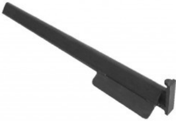
Steel Female Rail (Outer Axle Tube)