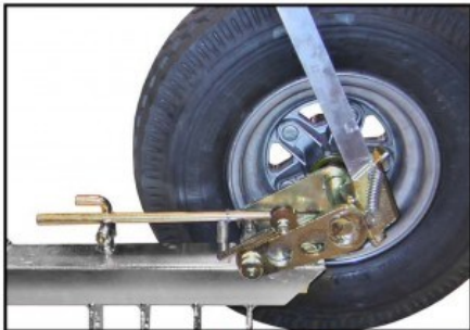
Pry Bar — 1" Square Aluminum Length: 5 ft — 152 cm Weight: 5.9 lb — 2.7 kg Material: 6061-T6 Aircraft Grade Aluminum