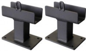
Dolly Mount (4.80 Short — 4”)