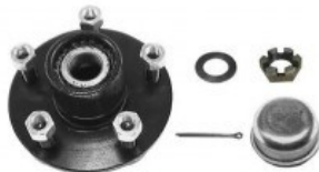
Hub Complete, Steel, 5-Lug; Includes: Races, Bearings, Spindle Nut, Washer, Cotter Pin, Grease Seal, & Dust Cover