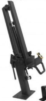
Dolly Mount (Self-loading—Half)