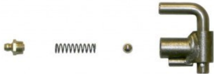
Safety Lock—SLX Dollies Complete Assembly