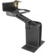
Dolly Mount (Parallel-Motion—Half)