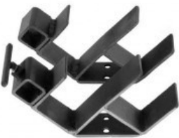
Dolly Mount (Cross Rail — Slanted)