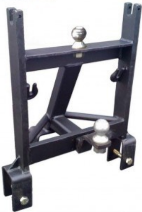
Fifth Wheel Hitch Mount (15,000 lb. Vertical Capacity) (Ball, Goose Neck Ball, & Pintle Hook Hitches not Included)