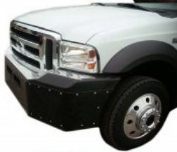
Ford F250-F550 Push Bumpers 05-07