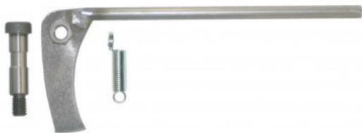
Trip Assembly/Left—SLX Dollies Includes Shoulder Bolt and Spring