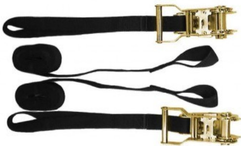
Safety Tie-Down Straps—w/Ratchet Buckles (Four Pieces)