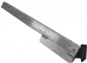
Female Rail Aluminum (Outer Axle Tube)