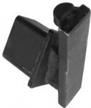
Steel Rail End for Aluminum Cross Rails