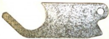
Ratchet Assembly Body —SLX Dollies