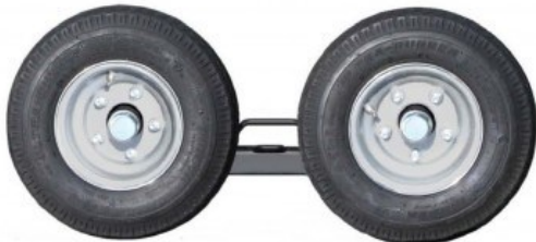
DOLLY FRAME COMPLETE w/STEEL HUBS, STEEL 5-LUG RIMS 4.80x8 C-RANGE TIRES BLACK COATING STANDARD