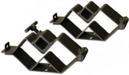
Dolly Mount (Cross Rail — Locking)