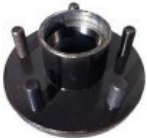
Hub Bare, Steel, Painted