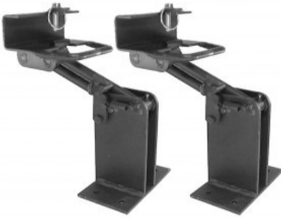
Dolly Mount (Parallel-Motion) — Articulating