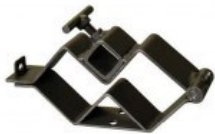
Dolly Mount (Cross Rail—Locking “T” Handle Half)