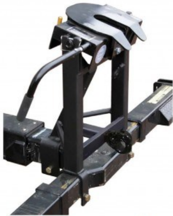
Fifth Wheel Hitch (15,000 lb. Vertical Capacity) (Ball & Pintle Hook Hitches not Included)