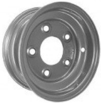
8" Wheel, Steel, 5-Hole, Silver E-Coated