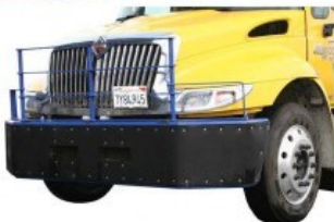
International Navistar 4300 Push Bumper 2002-Present