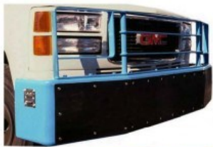
GM/Chevy 2500-3500 Push Bumpers 1992-1997