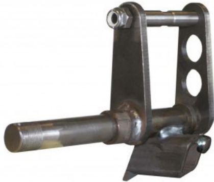
Spindle Assembly/Left —SLX Dollies Includes Machined Shoulder Bolt