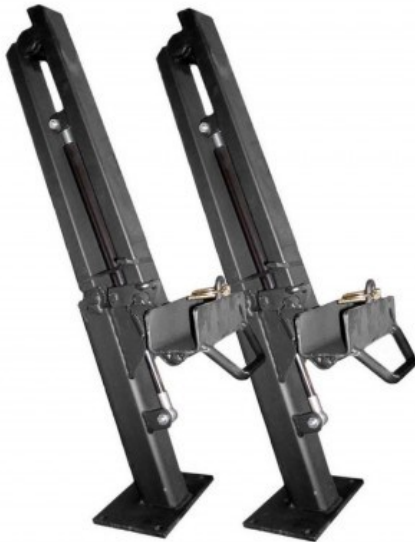
Dolly Mount (Self-loading w/Tire Cradles) — Articulating