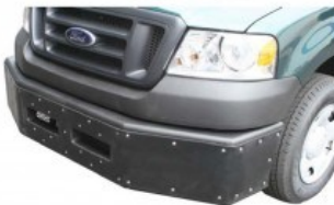
Ford 150 Push Bumpers 2004-2008