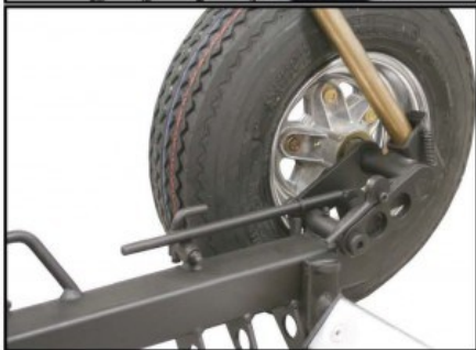
Pry Bar — 1" Round — Yellow Zinc Plated Length: 5 ft — 152 cm Weight: 13.4 lb — 6.1 kg Material: Drawn-Over-Mandrel Steel