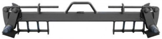
DOLLY FRAME — ASSEMBLED w/BARE SPINDLES