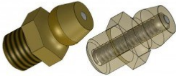
Grease Zerk — Threaded, Spring-Loaded, Ball Check