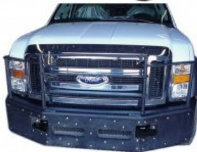
Ford F250-F550 Push Bumpers 08-10