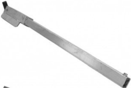
Male Rail Aluminum (Inner Axle Tube)