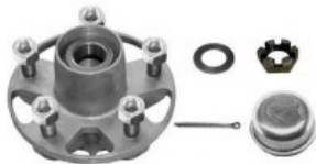
Hub Complete, Aluminum, 5-Lug; Includes: Races, Bearings, Spindle Nut, Washer, Cotter Pin, Grease Seal, & Dust Cover