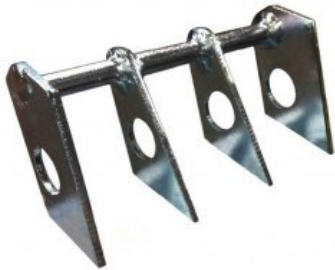
Rail Pocket Assembly —SLX Dollies