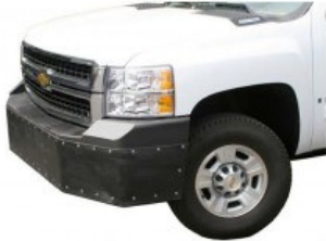
Chevy 2500-3500 Push Bumpers 2008-2010