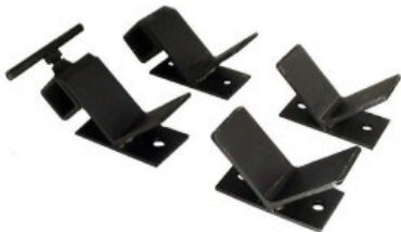
Dolly Mount (Cross Rail — Divided)