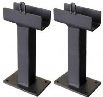
Dolly Mount (5.70 Tall—10”)