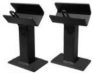
Dolly Mount (5.70—Slanted)