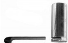
Rail Plunger, Stainless Steel (Old Style-Slotted)