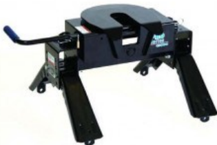
Fifth Wheel Hitch Head (Pickup Bed Stands Included)