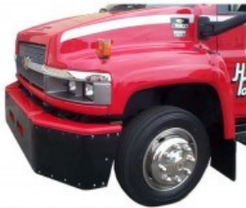
Chevy 4500-5500 Push Bumpers 2008-Present