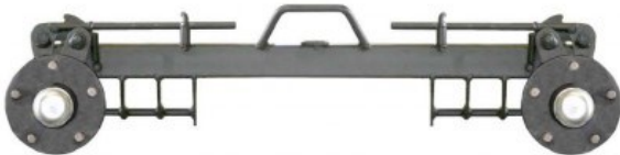
DOLLY FRAME w/STEEL 5-LUG HUBS