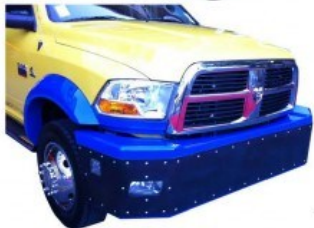
Dodge 3500-5500 Push Bumpers 2011-Present