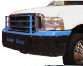
Ford 2500-5500 Push Bumpers 99-04