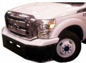
Ford F250-F550 Push Bumpers 11-Present