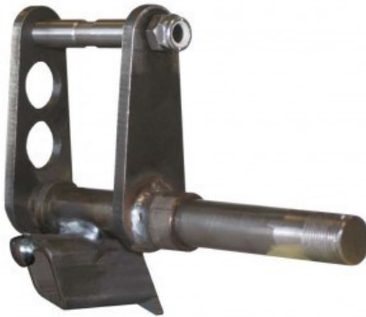
Spindle Assembly/Right —SLX Dollies Includes Machined Shoulder Bolt