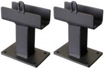
Dolly Mount (5.70 Short — 5”)