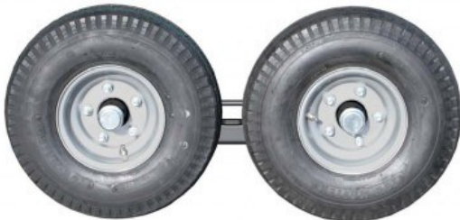
DOLLY FRAME COMPLETE w/STEEL HUBS, STEEL 5-LUG RIMS 5.70x8 D-RANGE TIRES BLACK COATING STANDARD