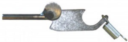
Ratchet Assembly/Left (New Style) —SLX Dollies 2006-Present