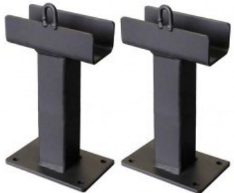
Dolly Mount (4.80 Tall—9”)