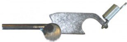
Ratchet Assembly/Right (New Style) —SLX Dollies 2006-Present