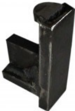
Steel Rail End for Steel Cross Rails