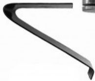
Rail Spring (Old Style — Flat Spring)