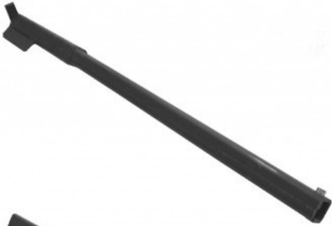
Steel Male Rail (Inner Axle Tube)