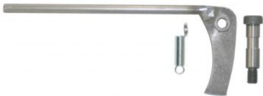
Trip Assembly/Right—SLX Dollies Includes Shoulder Bolt and Spring