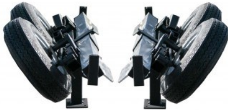
Dolly Mount (Combination): Dolly / Cross Rail / Pry Bar — Locking