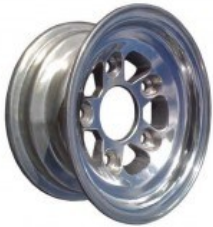
8" Wheel, Aluminum, 5-Hole, Slotted, Powder-Coated