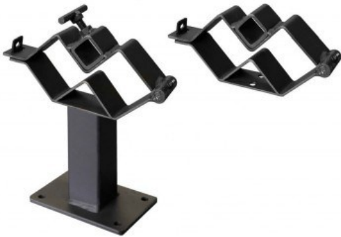
Dolly Mount (Cross Rail — Locking — Stepped)