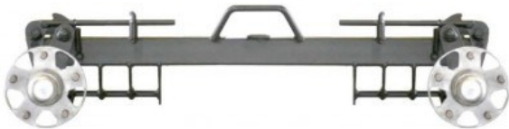
DOLLY FRAME w/ALUMINUM 5-LUG HUBS