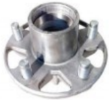
Hub Bare, Aluminum, Slotted, Polished, Greaseable