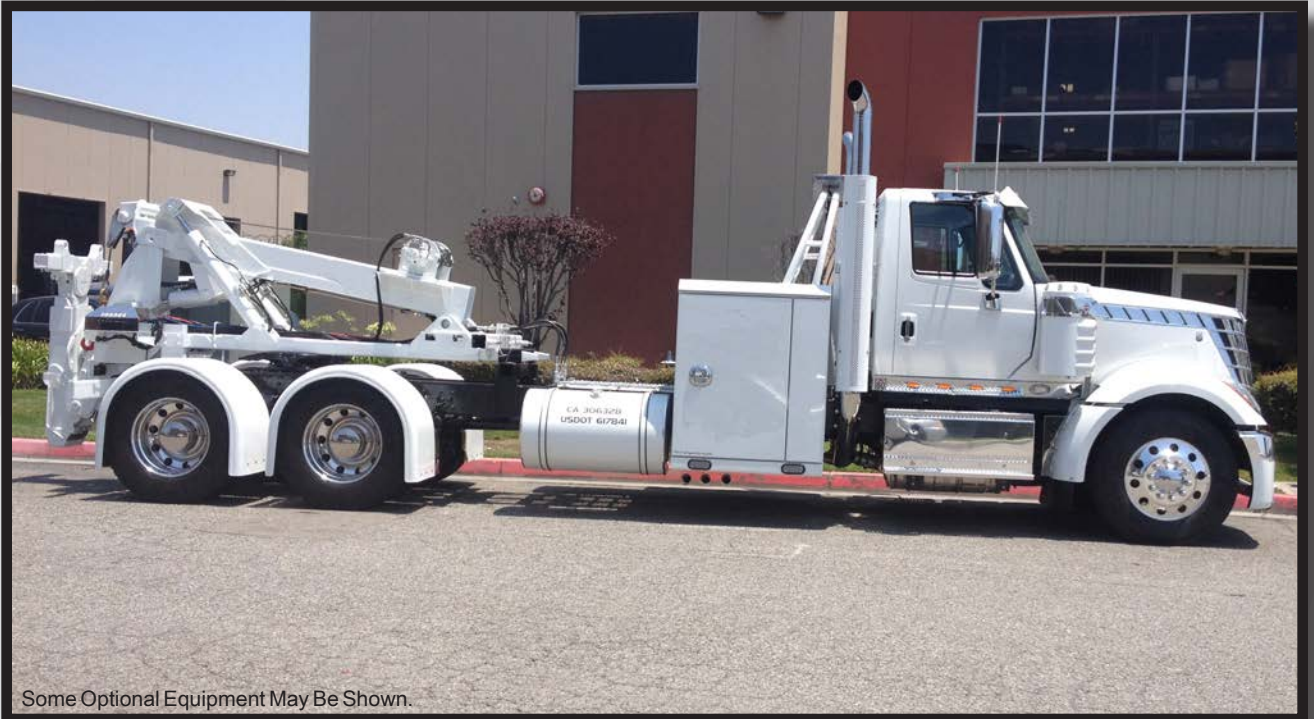
Some Optional Equipment May Be Shown.

The Holmes D.T.U. (Detachable Towing Unit) has been re-designed to decrease rear overhang, increase front axle weight, and offer better towability. With repositioned lift cylinders, the D.T.U. G2 also provides superior underlift height and further improved center of gravity and weight transfer. The unit comes standard with a 20,000 lb. planetary winch, 175' of 9/16" wire rope and front legs that allow the unit to be easily removed in a matter of minutes so your truck can be multi-functional for both towing and pulling trailers.