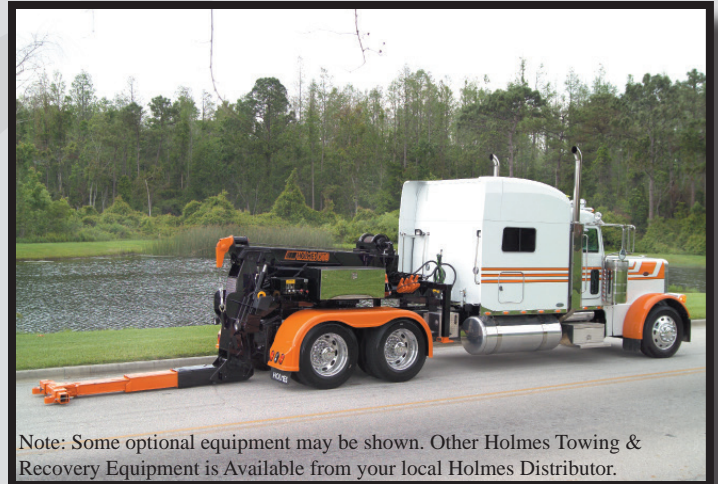
Note: Some optional equipment may be shown. Other Holmes Towing & Recovery Equipment is Available from your local Holmes Distributor.