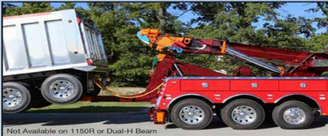
Not Available on 1150R or Dual-H Beam