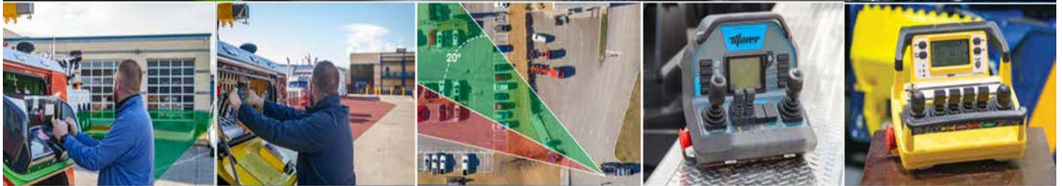
- Raptor ® Control Visibility vs. Standard Control Station