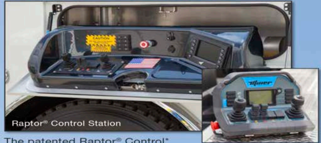
Raptor® Control Station

The patented Raptor® Control* Package is standard on the Century 1150R and optional on all other rotator models.