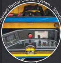
Patented Raptor Control System - Standard