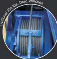
Optional 30k lbs. Drag Winches