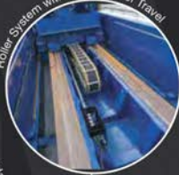
Roller System with over 12 ft. of Travel