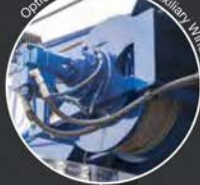
Optional Dual 30k lbs. Auxiliary Winches