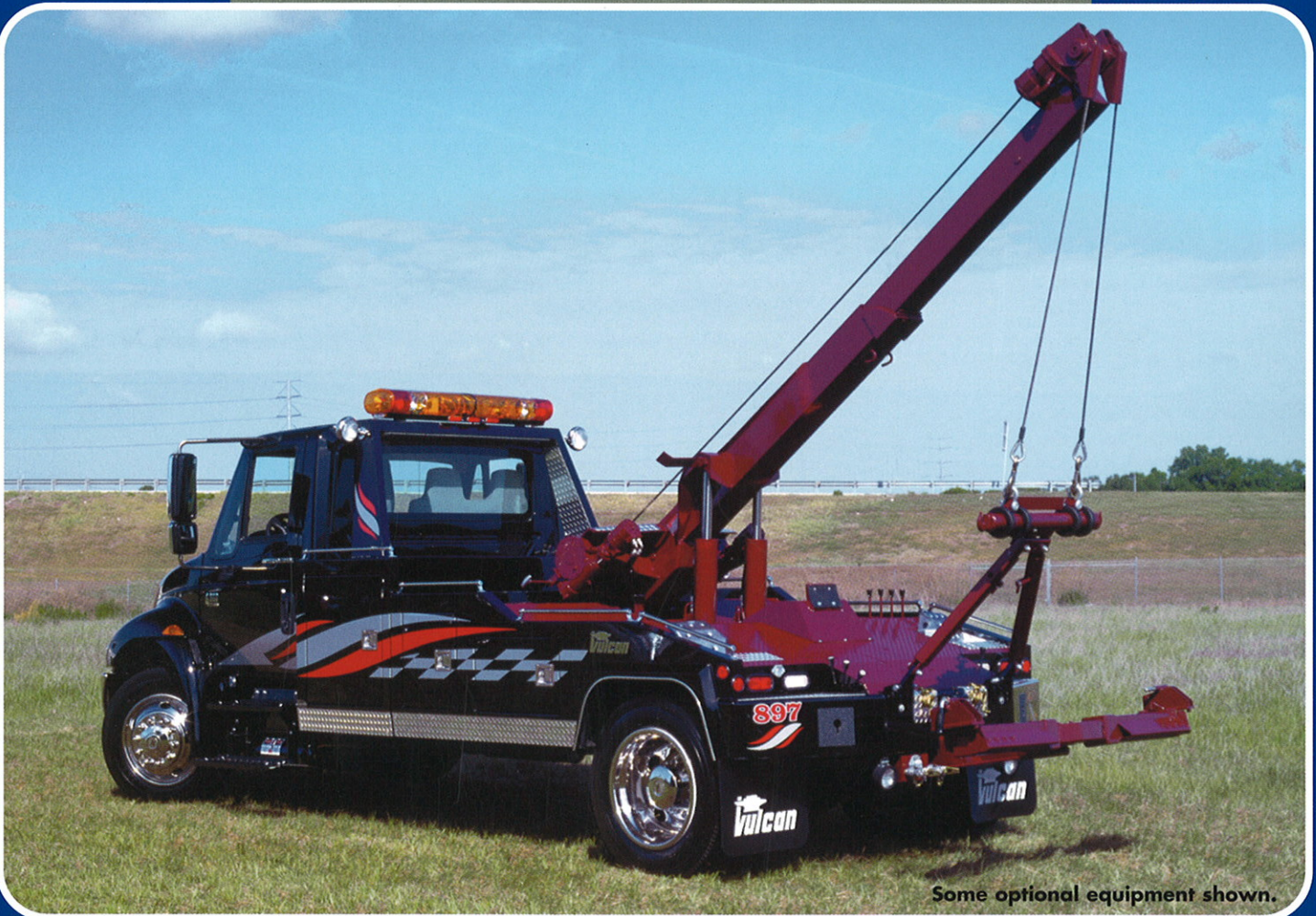
Some optional equipment shown.