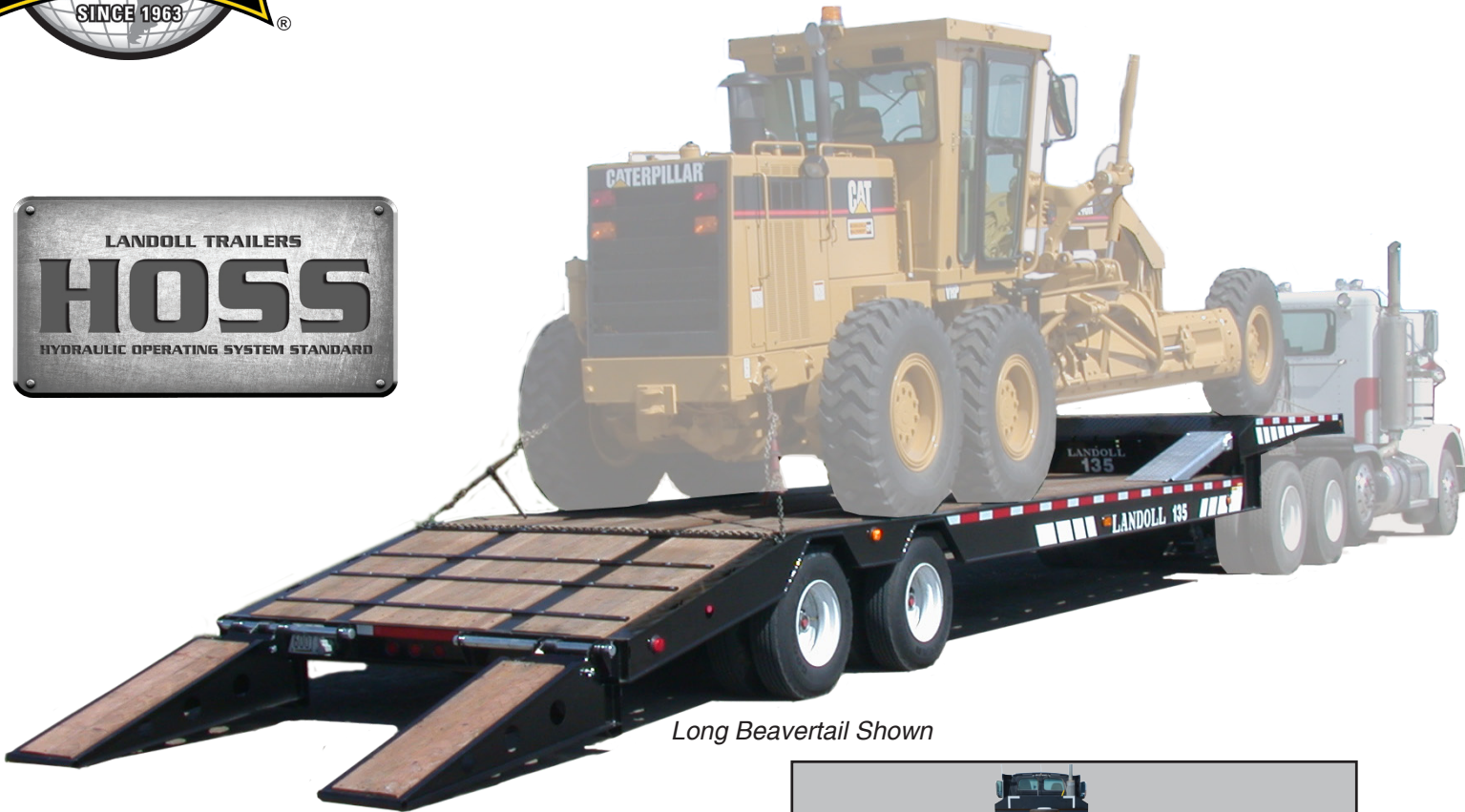
Long Beavertail Shown