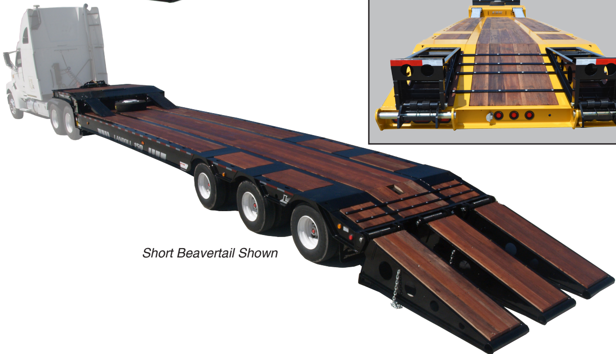
Short Beavertail Shown