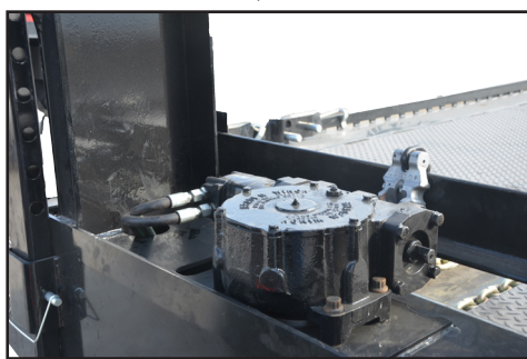
• Gear Box Drive System