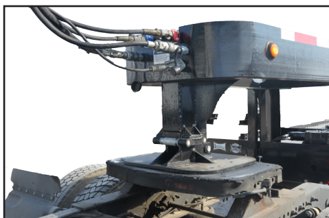
• Standard Fifth Wheel Hitch

Pictures and content may include optional equipment and/or standard features that may not be standard on all models. Specification and design subject to change without notice. Weights and measurements are best estimates and should not be treated as actual. There are other features and optional equipment available. If you have any questions, consult the factory.