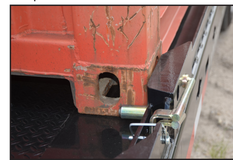
• Container Lock Down Side Pins