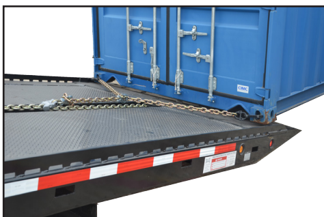
• Standard Continuous Chain Drive, Guide Rail Sides, Chain Bridle