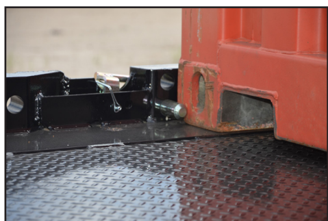
• Two Position Front Stops