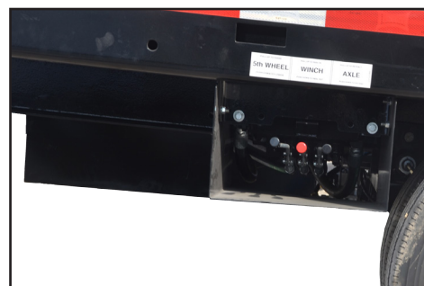
• Drivers Side Controls • Optional Wireless Remote Control