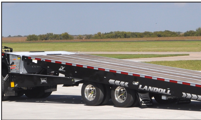
Smooth Transition to Upper Deck