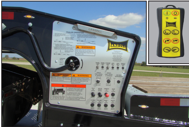
Easy to Operate Control Panel Enhanced Lighted Control Panel Optional Wireless Remote Control