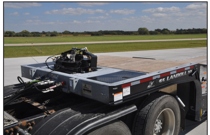
Easy Hook Up Hydraulics Upper Deck Lighted Toolbox