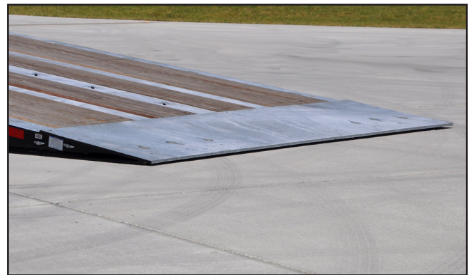
6.5° Low Load Angle

Proven Solutions for Your Hauling Needs! 1-800-428-5655 | www.landoll.com/trailers