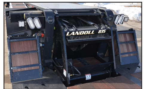
Optional Lights Shown

Proven Solutions for Your Hauling Needs! 1-800-428-5655 | www.landoll.com/trailers