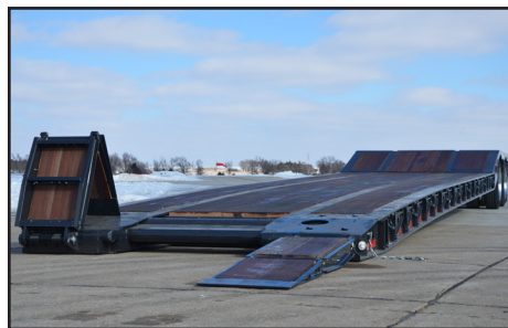
Standard Easy Fold Ramps in Load Position