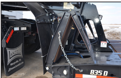
Standard Front Ramps in Transport Position