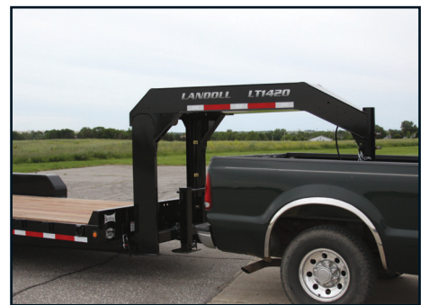
Gooseneck Connected to Hitch