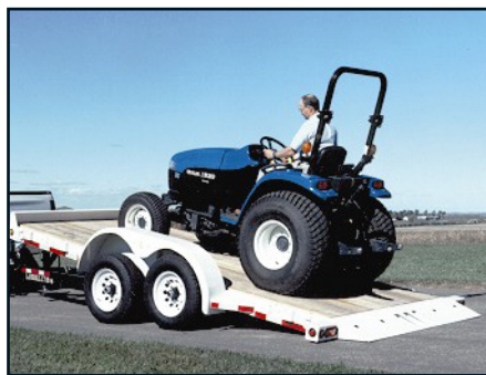
Low Load Angle