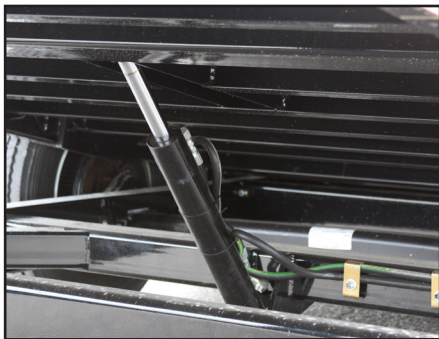
Tilt Cylinder and Frame