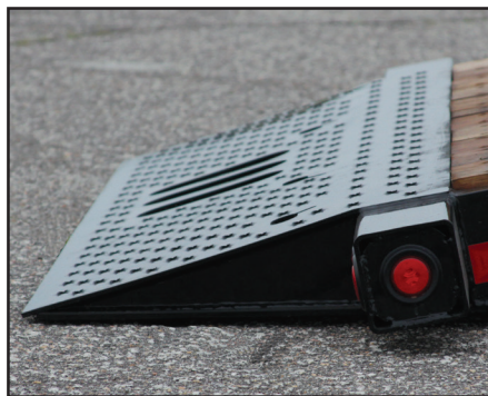
Light Bar and Landoll Traction Plate