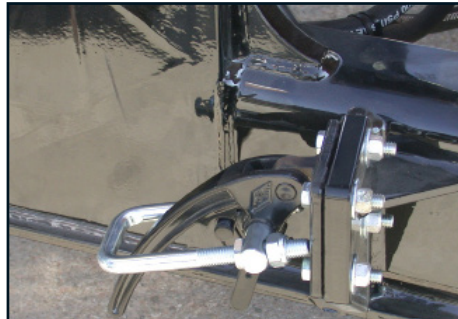
Deck Lock Latch