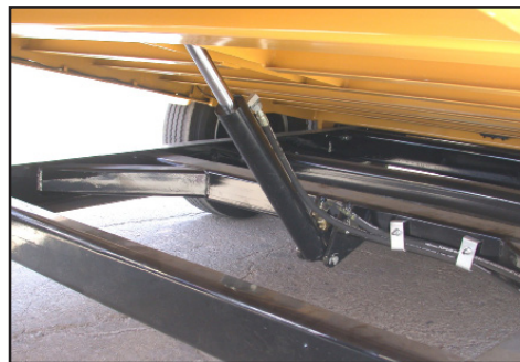
Tilt Cylinder & Frame