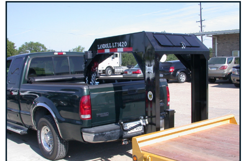
Gooseneck Connected to Hitch

Proven Solutions for Your Hauling Needs! 1-800-428-5655 | www.landoll.com/trailers