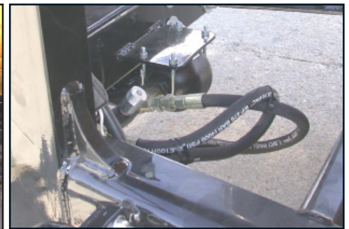
Accumulator and Valve