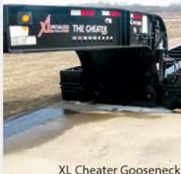
XL Cheater Gooseneck