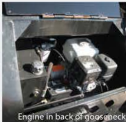
Engine in back of gooseneck

The Cheater's multiple king pin settings allow for variable swing clearances. The seven different ride height positions allow you to change the height and ground clearance of your trailer.