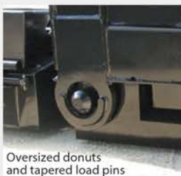
Oversized donuts and tapered load pins

The Cheater was custom-designed by XL engineers with the goal of saving drivers valuable time while increasing product flexibility . The innovative technology and design has proved useful in many applications, on many different models of XL trailers.