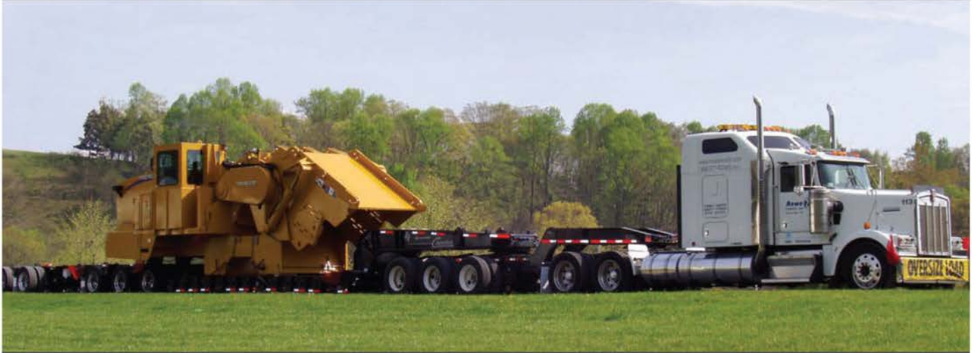
XL120 Cheater Hydraulic Detachable Gooseneck