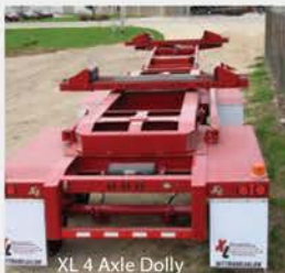
XL 4 Axle Dolly

With a 140° total load platform travel and 38" load platform height , these Dollies transport Bridge beams, pre-stressed concrete abutments, crane booms and asphalt plant chimney's, among other materials.