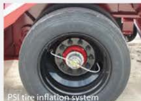
PSI tire inflation system