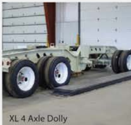
XL 4 Axle Dolly