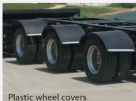
Plastic wheel covers