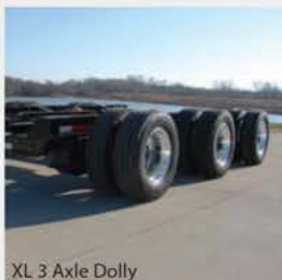
XL 3 Axle Dolly

Built with XL's one-piece construction process results in stronger products. I-beams made from one piece web and flange and then welded on all sides. Built with proven XL quality, the XL Dolly will stand up to your hauling challenges.