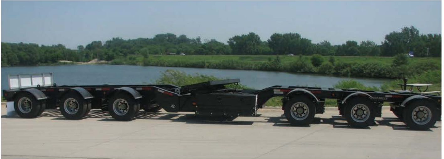
XL 6 Axle Dolly