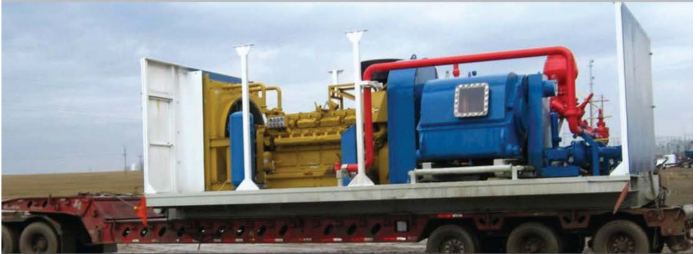
XL 100 Folding Gooseneck (Mechanical)