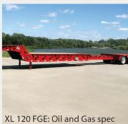
XL 120 FGE: Oil and Gas spec

XL Folding Gooseneck can be fully equipped for use in the oil field. With rollers including tail rolls , neck rolls , pop-up rollers and pick up eyes , the XL Folding Goosenecks easily accommodate your oil and gas hauling needs.