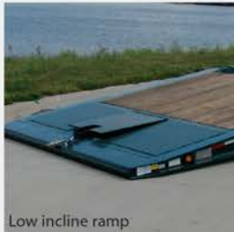
Low incline ramp