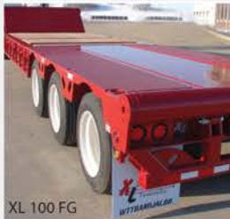
XL 100 FG

The XL Folding Gooseneck handles your heaviest hauling challenges. The low incline ramp makes it easy and safe to load and transport pavers, scrapers and other heavy equipment. The neck adjusts to uneven terrain without the use of blocks so you can load and unload almost anywhere.