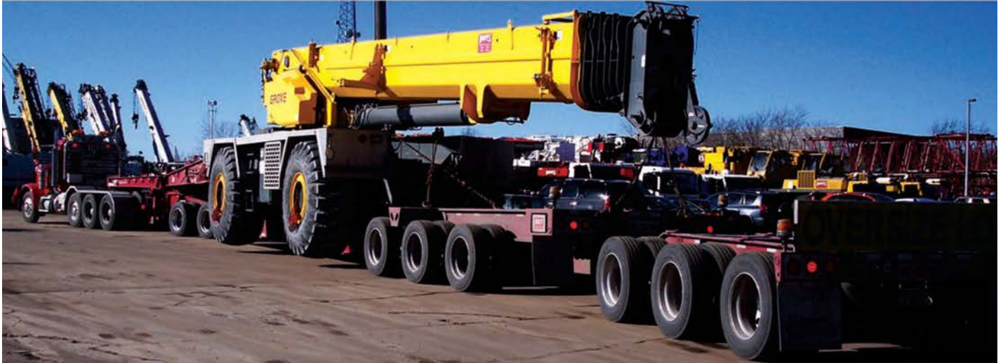
XL 150 Hydraulic Detachable Gooseneck 3+3+3 beam deck