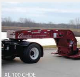
XL 100 CHDE

XL hydraulic necks are wider and stronger than the industry standard, offering increased stability for high center of gravity loads. The hydraulic support arm contacts truck frame rails only; there is no need to carry a 4 x 4 for blocking the neck.