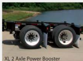
XL 2 Axle Power Booster