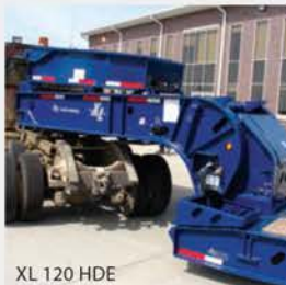
XL 120 HDE

7 position variable ride height makes hooking up to the truck easy. The different axle configurations , main deck widths, lengths and heights along with the ability to add a booster , provide superior versatility.