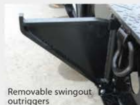
Removable swingout outriggers