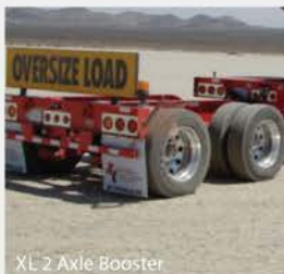
XL 2 Axle Booster