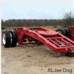
XL Joe Dog