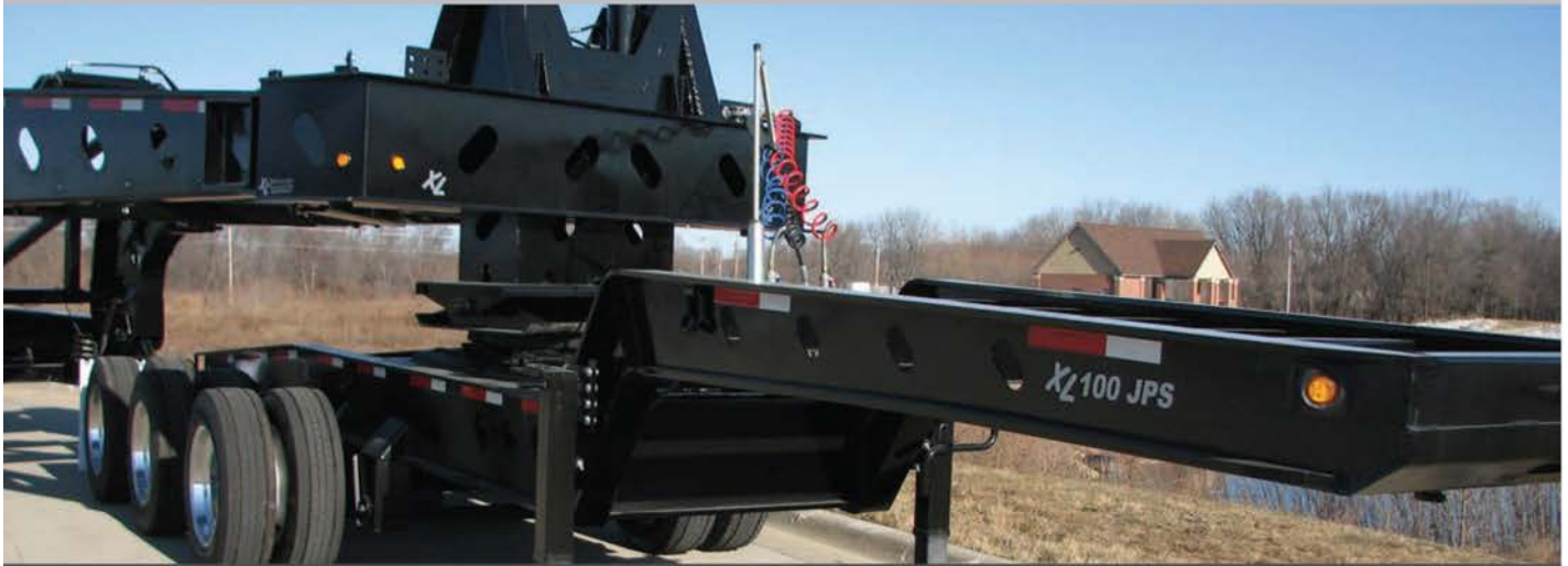
XL 100 Jeep with hydraulic hatbox