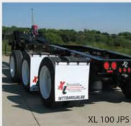
XL 100 JPS

XL Jeeps are designed to make your trailer more versatile. The ability to use the jeep in front of your trailer when needed to distribute the weight of the load , but remove when unnecessary makes you able to handle a wider range of loads.