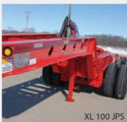
XL 100 JPS

XL's one-piece construction process results in stronger products. I-beams are made from one piece web and flange and then welded on all sides. Built with trusted XL quality, XL Jeeps will stand up to any challenge.