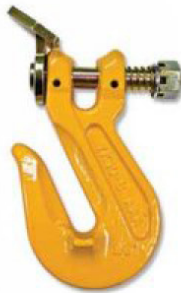
G80 Cradle Style Twist Lock™ Grab Hook PATENT# 7967353