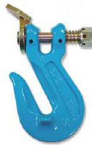
G100 Cradle Style Twist Lock™ Grab Hook PATENT# 7967353