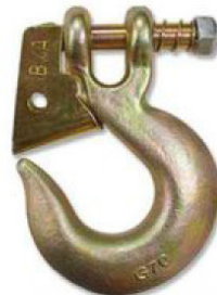
G70 Twist Lock™ Slip Hook PATENT# 9039055