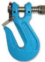
G100 Non-Cradle Style Twist Lock™ Grab Hook PATENT# 7967353