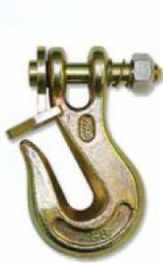
G80 Non-Cradle Style Twist Lock™ Grab Hook PATENT# 7967353

From over the road transport to overhead lifting our Patented Twist Lock™ family of hooks offer something for everyone.