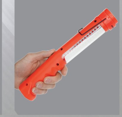
Flat bottom base