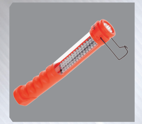
Integrated hook/prop stand