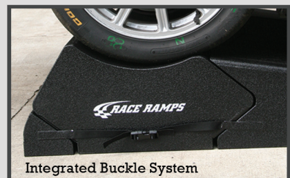
Integrated Buckle System