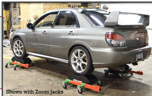
Shown with Zoom Jacks