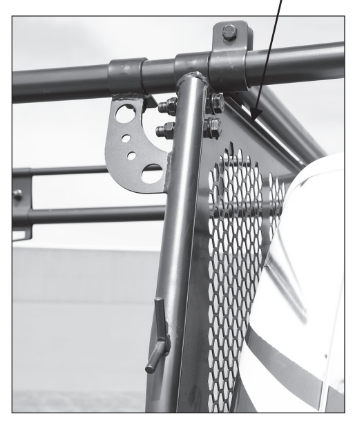
Fig. A Orientation