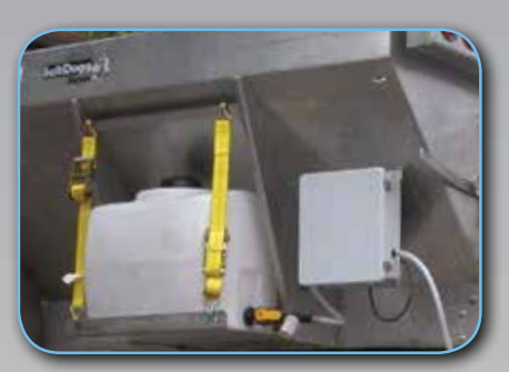
LS1 & LS3 (55 gal. poly reservoir)