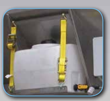
Optional LS1 Liquid Spray System (fits 4 & 4.5 yd.)