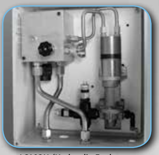
LS102H (Hydraulic Enclosure with Proportioning Valve)