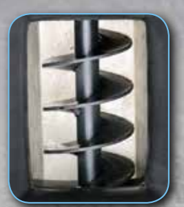
TGS07 Auger with Stainless Steel Trough