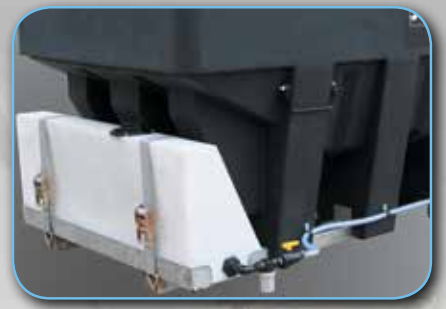
LS6 (30 gal. poly reservoir)