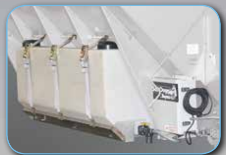
LS4 & LS5 (105 gal. poly reservoir)