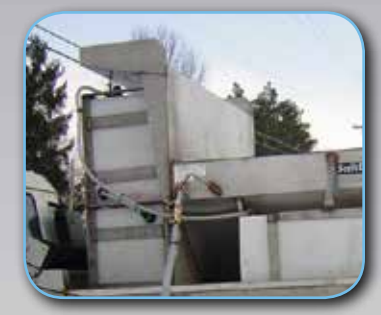
Optional Cab Guard (Part No. 1497051)