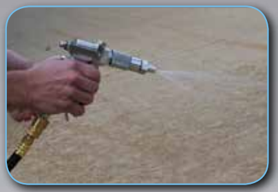
adjustable spray nozzle - pressure switch activates pump on demand