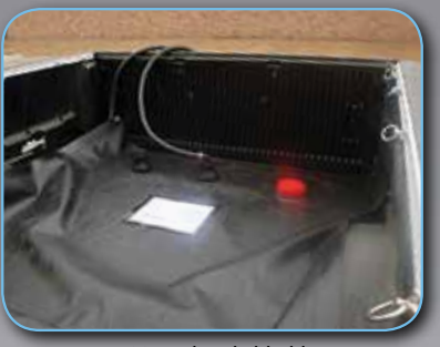
335 gal. poly bladder