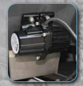
Standard Vibrator Shown