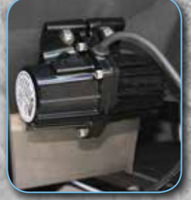
Prewired for Optional Vibrator Kit Shown Installed (3020340)