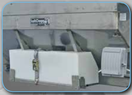
LS7 & LS8 (30 gal. poly reservoir)