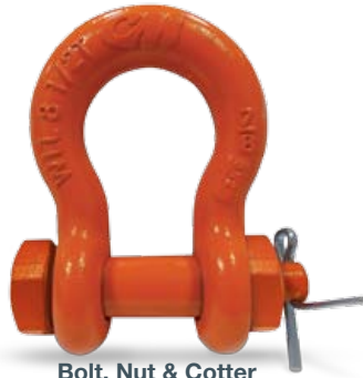
Bolt, Nut & Cotter