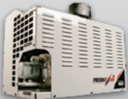
Hydraulic Air Compressor