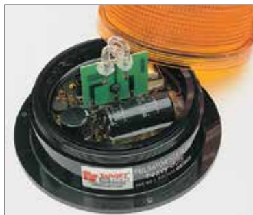
Heavy Duty Pulsator models use gel to protect complainants against vibration

Pulsator 451 Plus models are available in 8-joule (double and quad-flash) and 12-48 VDC versions. All models use a helical strobe tube that is easily replaceable. All models include the necessary mounting hardware.