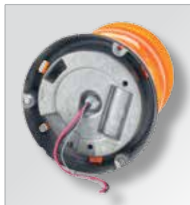
Permanent / 1" pipe mount bottom