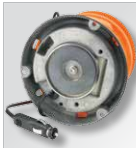
Magnetic mount bottom with cigarette plug