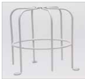
448330 Branch Guard option