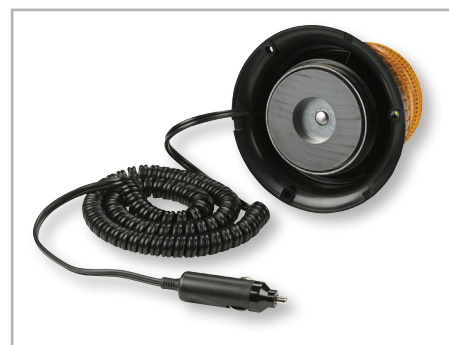
Magnet mount with cigarette-plug