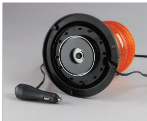
Magnetic mount cigarette plug option is available

Designed to meet the demands of a variety of work zones including snow plows, forklifts, utility trucks and construction vehicles; the Firebolt LED is made of a shatterproof, polycarbonate dome and base and includes an o-ring to help protect against moisture. The Firebolt LED has a built-in permanent/ ½" pipe mount base. Magnet mount models with cigarette plug are also available.