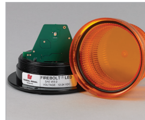
Shatterproof dome and base with o-ring protection against moisture