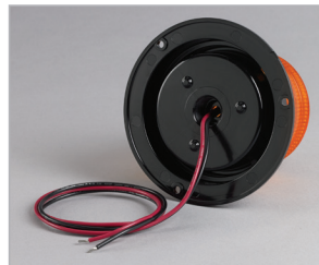
Built-in permanent / ½" pipe mount