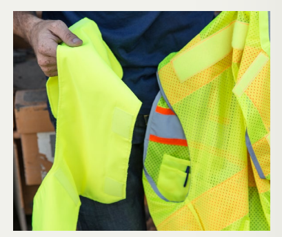
Fully removable cooling pad.