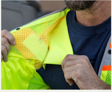
Hook & loop for easy removal.