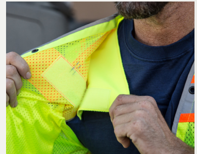
Hook &amp; loop for easy removal.