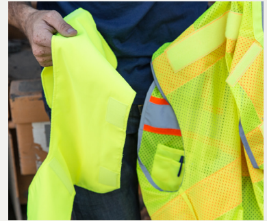
Fully removable cooling pad.