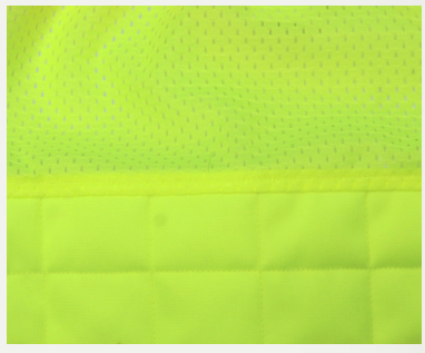
Quilt and mesh material.