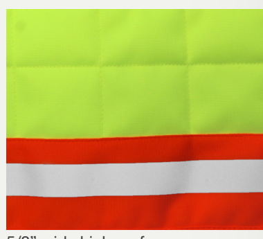
5/8" wide high performance reflective material with contrasting material.