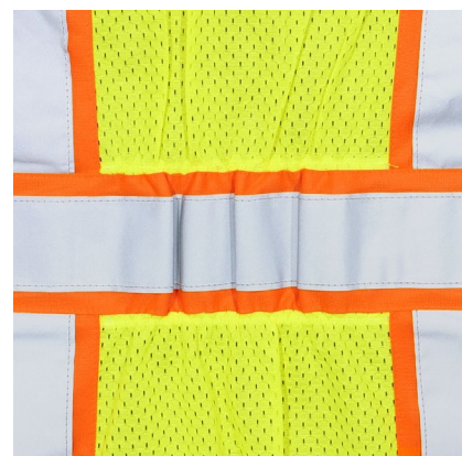
Elastic waist cinches to ensure a tailored fit.