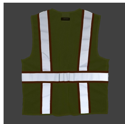
2" wide high performance reflective material with 3" contrasting color.