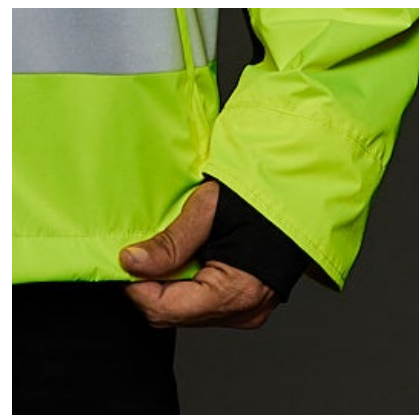
Cuff inserts with thumb hole at sleeve hem.