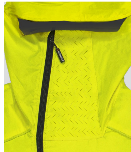
4 Layer filtration protection from non-toxic particles.