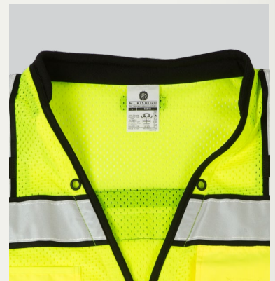
Padded neck for comfort