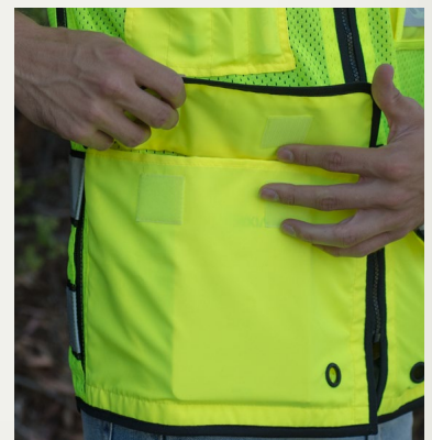
Lower full length front pockets.