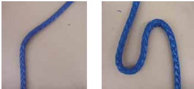
FIGURE 4 Frozen rope bent at 45° on the left and 180° on the right

In cold environments, there is a concern that ice may damage the rope through abrasion or cutting due to the ice's rigidity and sharp edges. To test this theory, we froze wet AmSteel®-Blue rope to -5°C (23°F) in two different configurations, as shown in Fig. 4.