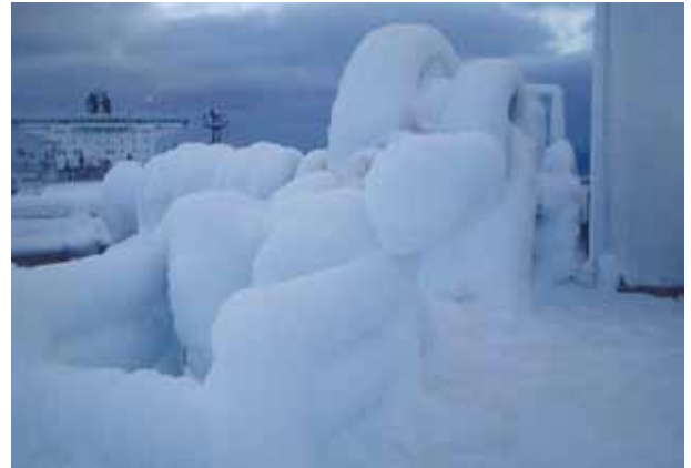
FIGURE 1 AmSteel®Blue mooring line on Shuttle Tanker KOMETIC buried in ice and snow