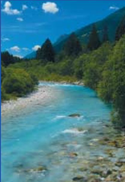
The Sava at Mojstrana

Conveyor belts have been manufactured at Sava for more than 50 years and throughout that time knowledge and experience have been invested in conveyor belt production to meet market demand as well as their safe and long-lasting use. Production is performed under extremely rigorous quality control conditions in all production phases. Conveyor belts, which are sold worldwide, are manufactured by employing a high level of technology and checked in use. Our experts will be pleased to assist in selecting or calculating the right belt type while taking into consideration your special requirements.