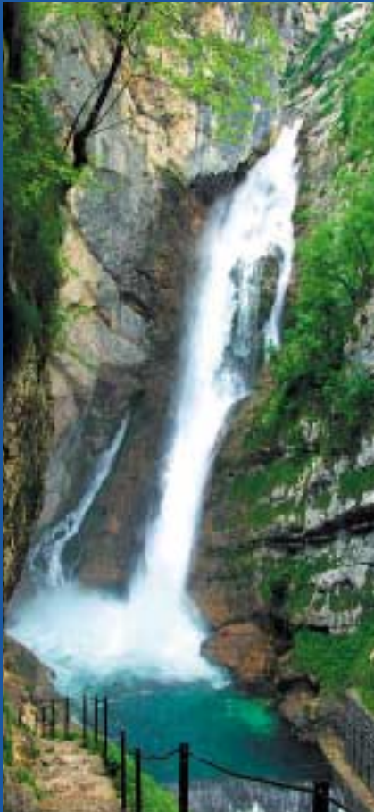
The Savica Waterfall

Savatech d.o.o. - the pillar of development of the Rubber Manufacturing division in the Sava Group