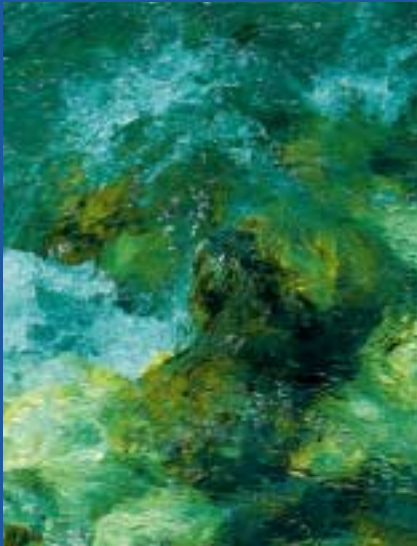
The rapids of the Sava at Martuljek

Sava has been gaining vast expertise and rich experience in developing and blending rubber compounds for rubber products as it has been in this business ever since 1920.