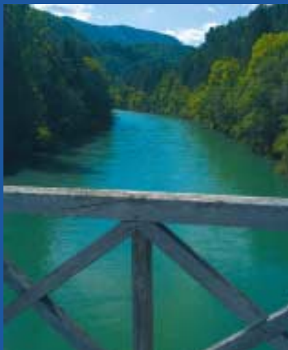
The Sava at Globoko

An experienced team of engineers provides strong technical support for all Savatech programmes. In addition to designing and constructing special technology equipment components the team assists in the selection of optimum equipment manufactured by foreign suppliers or demands improvements in process units in accordance with end user requirements. It also assures re-engineering of existing equipment and reliable commissioning of new equipment in properly designed production plants.