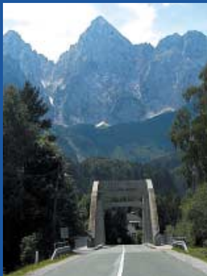
A bridge over the Sava at Martuljek