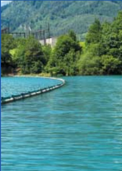
A dam on the Sava at Jesenice

A dynamic programme that is renowned for its innovation and a professional and friendly approach. The goal of the programme is to develop trust, which gives rise to success, for the benefit of both our partners and ourselves.