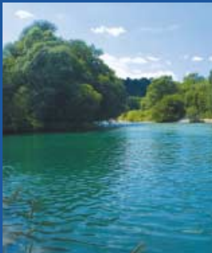
The confluence of the Sava Bohinjka and Dolinka at Lancovo

Since 1970 we have been designing and manufacturing rubber seals made from quality rubber compounds for a wide selection of applications in compliance with all required international standards ISO 9001 and ISO 14001.