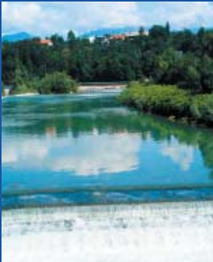
A dam on the Sava