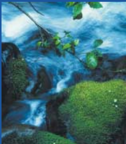
A spring at the Sava

The central laboratory of Savatech's R&D Institute is a modern facility performing laboratory work in the field of physics, chemistry and polymer technology. It consists of a physics laboratory and chemistry laboratory, the former also possessing a prototype unit and armature laboratory unit. The central laboratory is accredited with the standard SIST EN ISO/IEC 17025.