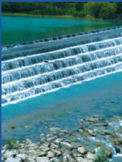
The Sava at Jesenice

In 15 years of its operations the Print programme has become an important European manufacturer of rubber printing blankets for the printing industry, and as a part of a well-organised sales network it offers its products and services on all continents. One of the key orientations of the programme is to offer reliable quality products and provide appropriate technical support worldwide.