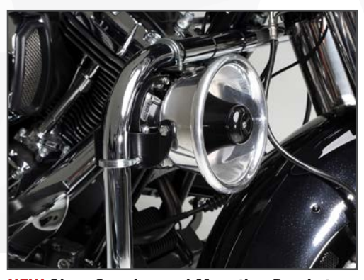
NEW Siren Speaker and Mounting Bracket 100 watt speaker with polished aluminum flare SA350MH, SA350MB1