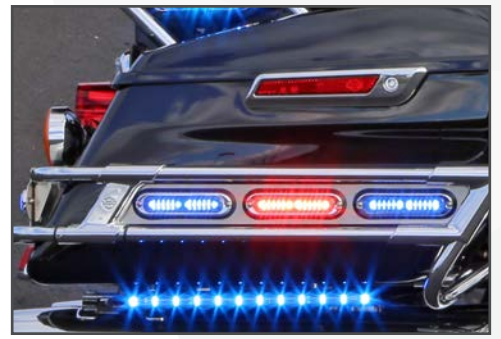
NEW Side Crash Bar Mounting Bracket Kit/Side Side Fork Mounting Bracket Kit allows for easy (Saddle Bag) Crash Bar Mounting Bracket Kit allows for easy mounting of three ION T-Series or surface mount ION lightheads. Durable stainless steel construction.