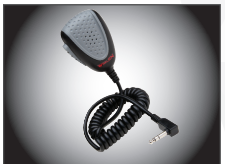
Microphone for WS321 Noise canceling microphone