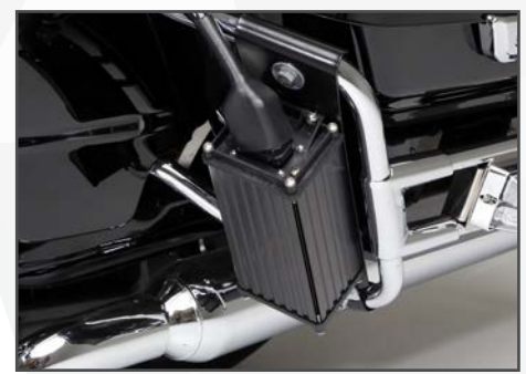
100 Watt Siren and Mounting Bracket Kit Includes Harley Davidson® wiring harness, four tones, and public address. Microphone purchased separately.