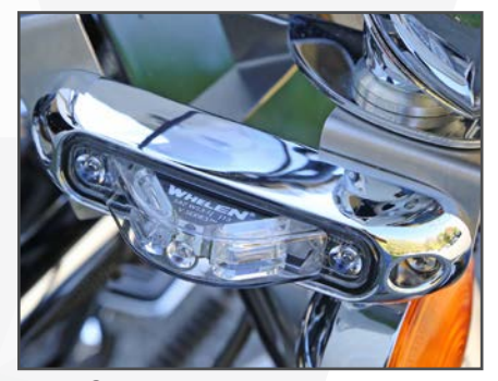
NEW Side Fork Mounting Bracket Kit mounting of one surface mount ION lighthead at 90°. Durable stainless steel construction.