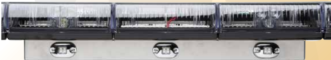
Red LED Identification Light (JF02AAAA only)