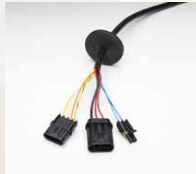
OEM Plug & Play Harness