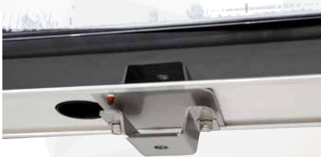
OEM “U” Bracket Mounting