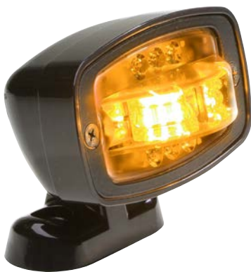
V23ATPB with V23PEDB