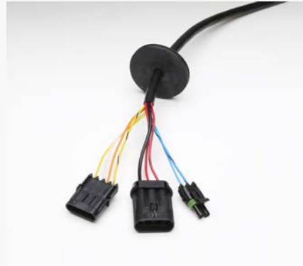
OEM Plug & Play Harness