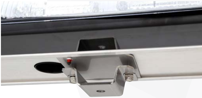
OEM "U" Bracket Mounting