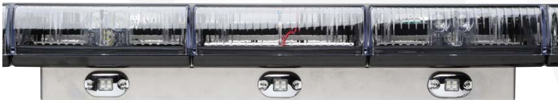
Red LED Identification Light (JF2AAAA only)