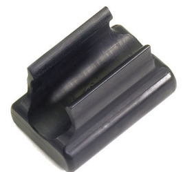
Includes magnetic clip for hands-free use