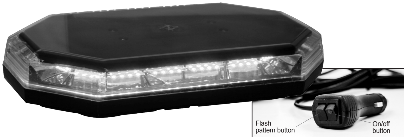
Flash pattern button On/off button