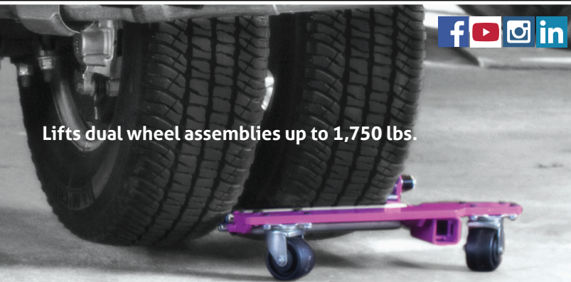
Lifts dual wheel assemblies up to 1,750 lbs.

All GoJAK® Models include an unprecedented 7 Year Limited Warranty