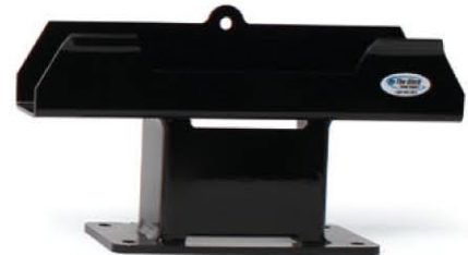
Short Simple Mount ITD1353

Fits XD™ Dolly Only Height: 9" Product Weight: 6 lbs.