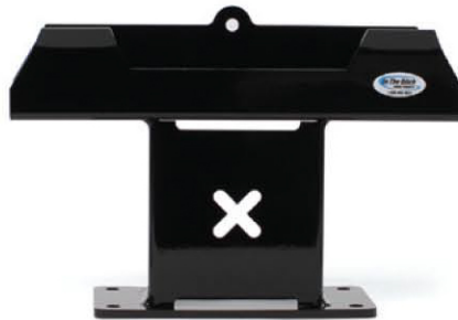
XD Simple Mount ITD1354

Fits Speed® Dolly Only Height: 9.5" Product Weight: 7 lbs.