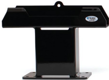
Standard Simple Mount ITD1352

Fits Speed® Dolly Only Height: 9.5" Product Weight: 7 lbs.