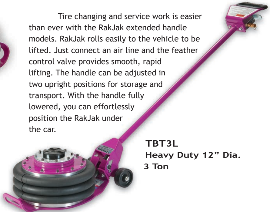
TBT3L Heavy Duty 12" Dia. 3 Ton

In the tire and repair shops RakJak's proven reliability and durability have shown thousands of technicians a fast, cost effective means of lifting vehicles on a repetitive basis. Emergency repair highway companies have also benefited from RakJak. The highly maneuverable, compact design saves time and is easier to move than a floor jack. The large flat base is steady and resists digging in soft pavement.