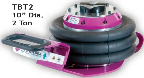
TBT2 10" Dia. 2 Ton

RakJak is one of the most useful tools in the body shop. It's compact, powerful and very fast to use. RakJak is simply the easiest and fastest way to install pinch weld clamps on the frame machine.