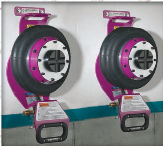
Long handle retro kit

- Scott West West's Road Service Delmar, N.Y.