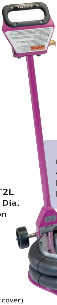
DBT2 (on cover)