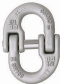
A-1337 10 Alloy Connecting Link

* Proof tested at 2 times Working Load Limit. Ultimate Load is 4 times the Working Load Limit.