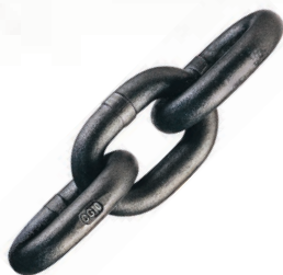
Spectrum® 10 Grade 100 Alloy Chain