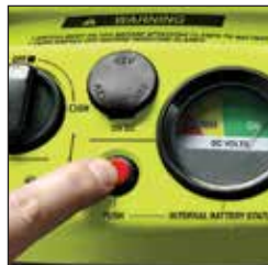
Internal battery status gauge.