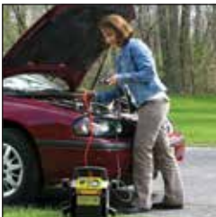
Starts any vehicle quickly with 55" long reach cables.