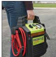
Easy to pack along and use.