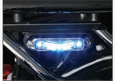
Surface Mount ION™ Under Radio Box Mount Kit

Under Radio Box Mounting Bracket Kit for one ION or ION V-Series™ surface mount lighthead. Available in curb side or road side in Black.