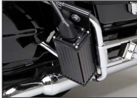
100 Watt Siren and Mounting Bracket Kit Includes Harley Davidson® wiring harness, four tones, and public address. Microphone purchased separately.