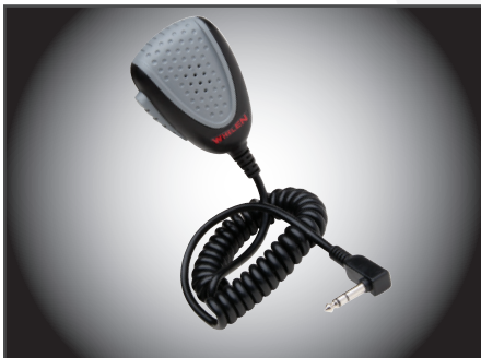
Microphone for WS321 Noise canceling microphone