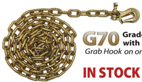
G70 Grade 70 Chain with Twist Lock™ Grab Hook on one end