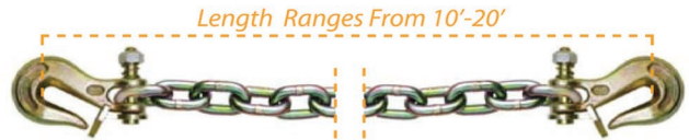
G70 Grade 70 Chain with Twist Lock™ Grab Hooks on each end