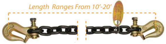
G80 Grade 80 Chain with Twist Lock™ Grab Hooks on each end