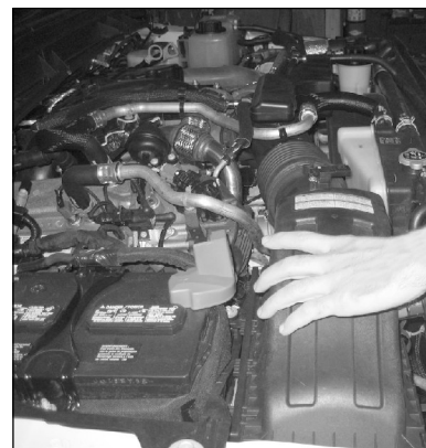
REMOVE AIR BOX