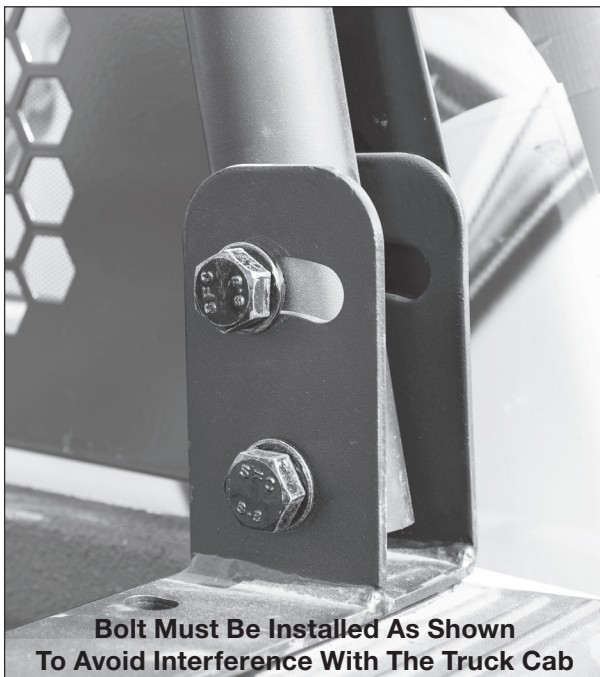
Fig. B Bolt Orientation