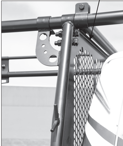
Fig. A Orientation